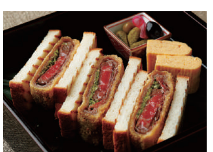
Wagyu filet cutlet sandwich