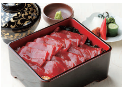
Bluefin tuna sashimi over rice