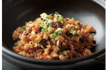
Claypot rice simmered with abalone, truffle and dried scallop